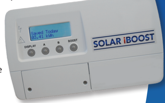
Dims: 260 x 130 x 64mm Wt: 505g

"It's great to get home and find you've got a tank of free hot water!" Adam & Su Payne